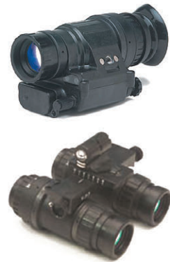
'Slim' ANVIS inverting tube is compatible with AN/PVS 6, 9, 14 and many other devices